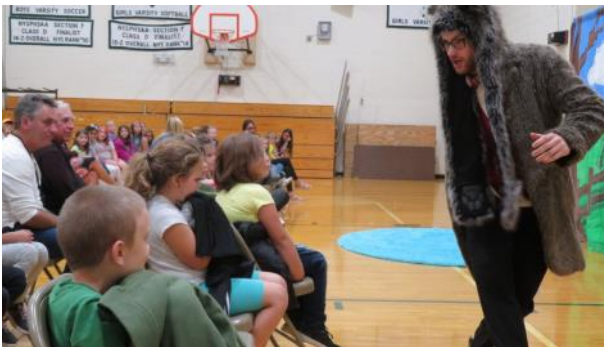
“Ugly Ducking” Seagull Festival at Minerva CSD