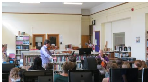
Music Symposium at Ticonderoga School