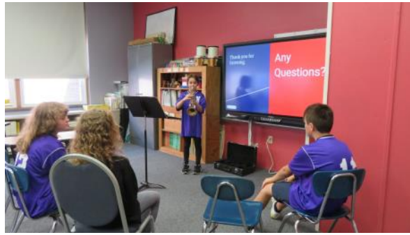
Instruments of the Orchestra Presentation by 5th and 6th Graders