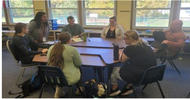
Newcomb's Positive School Environment Team (PSET) Leaders